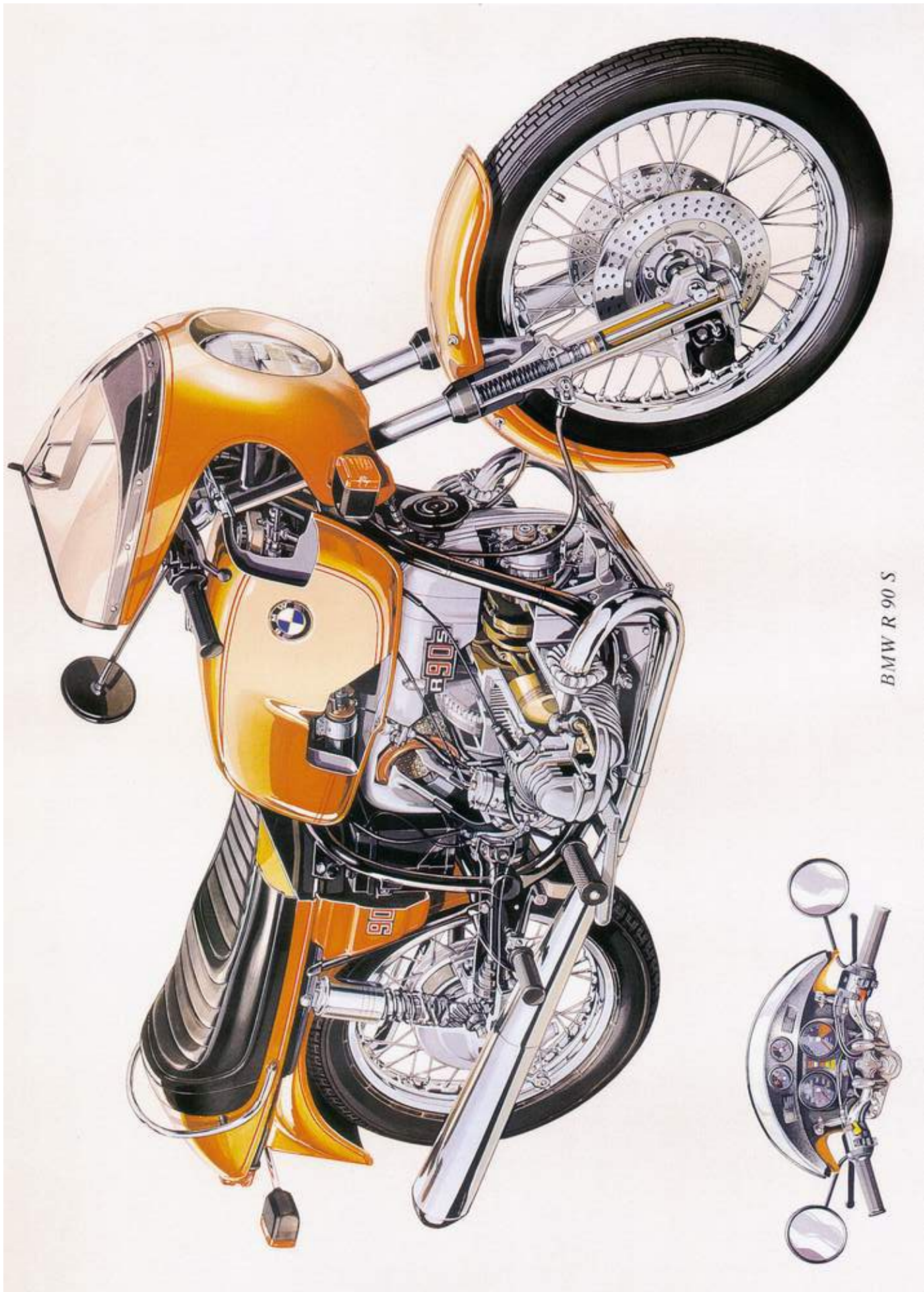
BMW R 90 S